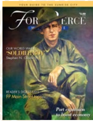
FORT PIERCE MAGAZINE Publishes February