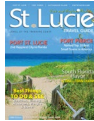
ST. LUCIE TRAVEL GUIDE Publishes December