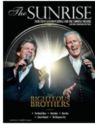
SUNRISE THEATRE PLAYBILL Publishes September