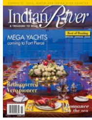
SUMMER Publishes May