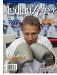
FALL Publishes October