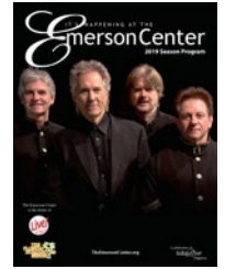
EMERSON CENTER PROGRAM Publishes February

Yes, I will advertise in the next edition of Fort Pierce Magazine in the following ad size: