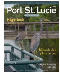
FALL Publishes September

Yes, I will advertise in the above checked issue(s) of Port St. Lucie Magazine in the ad size checked at right: