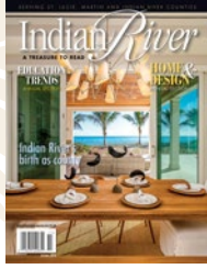
SPRING Publishes March