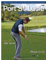
WINTER Publishes January