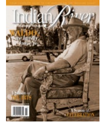
HOLIDAY Publishes November

Yes, I will advertise in the above checked issue(s) of Indian River in the ad size checked at right: