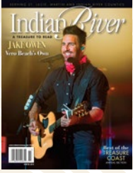
WINTER Publishes Jan

Make sure your business is represented in 2019 in the leading magazines in St. Lucie County and the Treasure Coast.